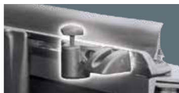
Height Adjusters Prevent Unnecessary Paint Wear