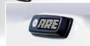
Black Lever Handle