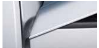
Front Fits Down and Over Truck Bed