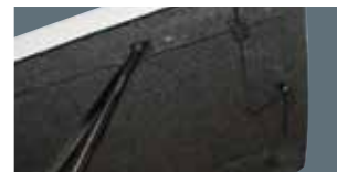
Gray Carpet Interior