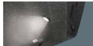
Carpeted Hardware Shroud with Interior Light