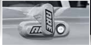
Automotive Grade Lock System