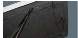
Gray Carpet Interior