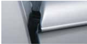
Extra Width at Front Corners