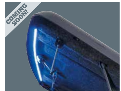
LED Lighting System