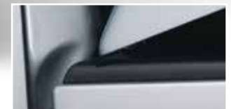
Front Opens Up and Away from Truck