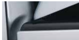
Front Opens Up and Away from Truck