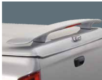
Sport Wing with or without Brake Light