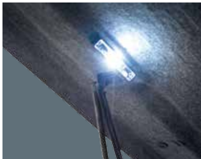
LED Prop Light™ (battery powered)