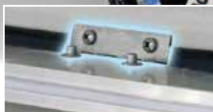
Stainless Steel Hinges