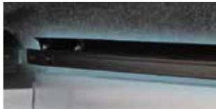
Continuous Hinge System