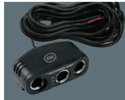
12-Volt Power Strip