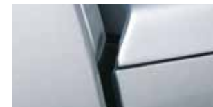
Precise Front Fit