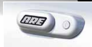
Automotive Grade Lock System