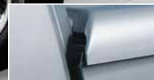
Extra Width at Front Corners