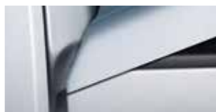
Front Fits Down and Over Truck Bed