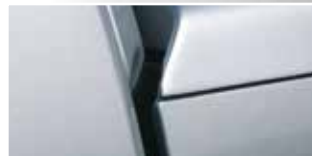
Precise Front Fit