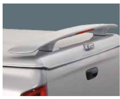
Sport Wing with or without Brake Light