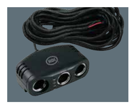
12-Volt Power Strip