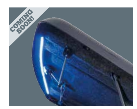
LED Lighting System