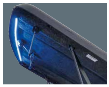
Rival<sup>™</sup> LED Rope Lighting