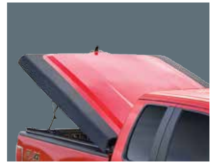
Overland Option – Spray-on Protective Coating Provides Two-toned Design