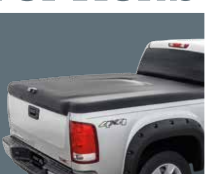
OTR Option - Full Protective Coating