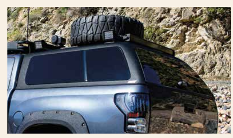
Spray-on protective coating increases strength in high stress areas.